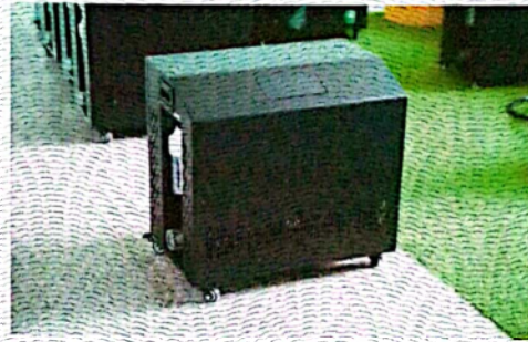
Ice bath chiller

Address: 4th Floor, Block A, No. 46 Yudaihe East Street, Tongzhou District, Beijing/4th Floor, No. 46 River East Street, Zhengzhou District, Beijing If there is any objection to the test report, it should be submitted to the testing unit within 15 days from the date of receipt of the report. Overdue will not be accepted.